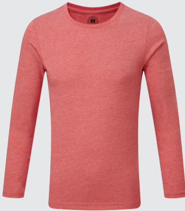
T-Shirt aus Polybaumwolle speziell zum Bedrucken