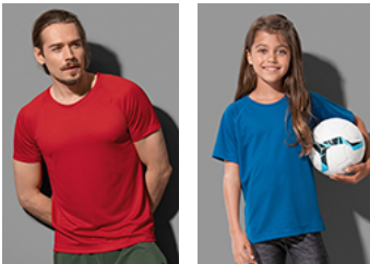
ST8410 Active 140 Raglan