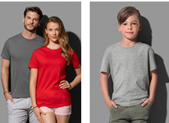
ST2020 Classic-T Organic