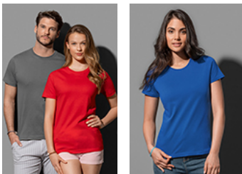
ST2020 Classic-T Organic ST2620 Classic-T Organic Fitted