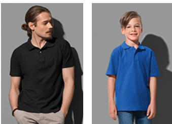
ST3000 Polo ST3200 Polo Kids