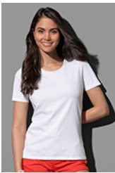
ST7600 Lux Fitted