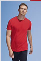
SOL'S Imperial 11500